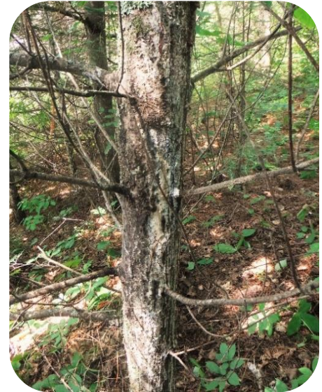
A weeping blister rust canker.

White Pine Blister Rust is a disease affecting white pine trees that is caused by a pathogenic fungus. Signs of infection include orange pustules on the branches and stem, cankers that weep resin, and from a distance, a dead branch (with noticeable red needles) on an otherwise healthy tree. White pine blister rust can be fatal if the infection encircles the trunk of the tree.