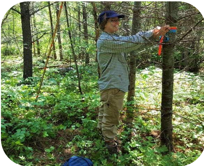
Monitoring resistant trees.