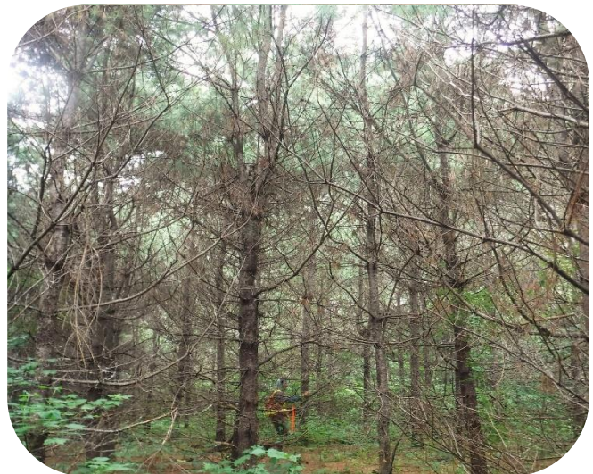
A planted resistant pine stand.