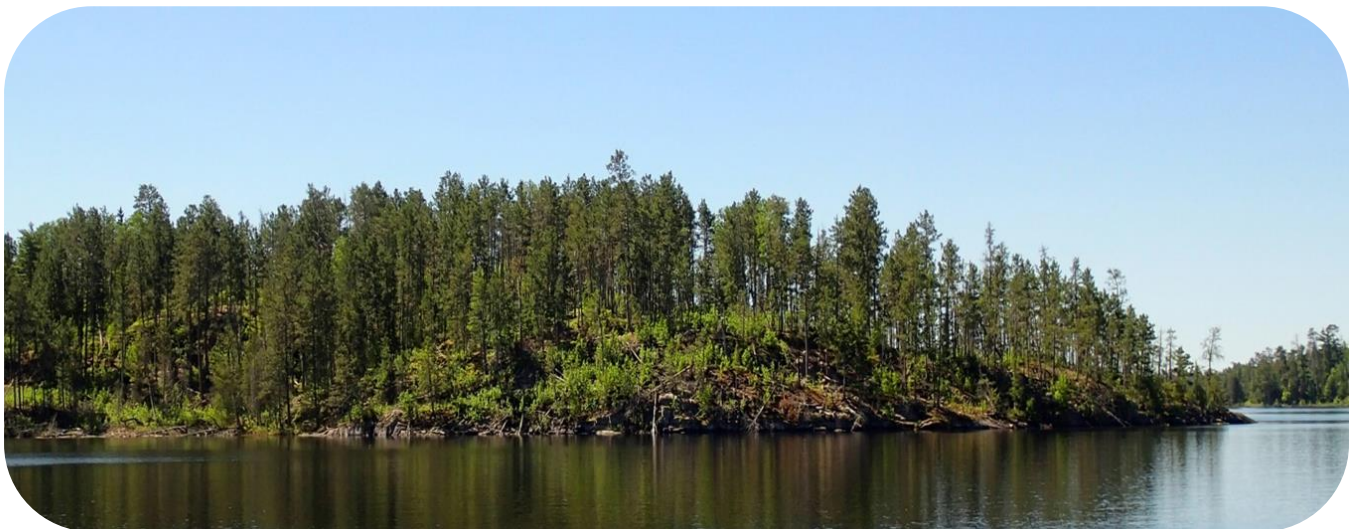
A recently burned pine stand with red and white pine regeneration.

During the summer of 2017 the Quetico Foundation Summer Student Research Crew surveyed 57 vegetation plots in pine forests throughout Quetico Park. These plots are in areas that are planned for a prescribed burn in the next few years. Their assessments give managers a picture of the forest composition and structure after decades of fire suppression. In future years this picture can be compared to the forest stands that regenerate after a fire. This comparison will allow for an assessment of how effective prescribed fires are at maintaining pine forests and help predict the composition of future forest stands based on what exists today.