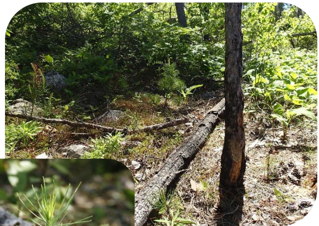
Right: Regeneration in a recently burnt pine stand.