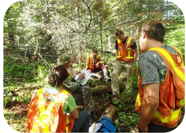
Crews learn to classify forest stands.

Quetico is well known for its stately red and white pine forests: windswept, open, and home to a variety of plants and animals. These pines are fire dependant; they require frequent, low intensity fire to remain on the landscape. Low intensity fires open up the forest canopy, return nutrients to the soil, and clear away accumulated dead wood and leaves, creating the perfect conditions for young red and white pine seedlings to thrive. However, through most of the 1900s, every effort was made to put fires out (remember Smokey the Bear?). Resource managers throughout the boreal forest are now working to reintroduce fire back onto the landscape through carefully planned prescribed burns and active management of natural fires. But how can we know if these efforts are in fact benefiting pines?