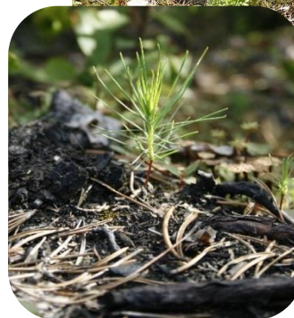
Center: A pine seedling growing after a fire.

Keep an eye out for research crews in the Park over the next couple years; they will be monitoring the same stands post-fire.