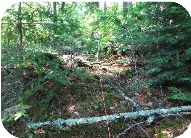
Above: A typical pine stand today with a dense shrub layer.